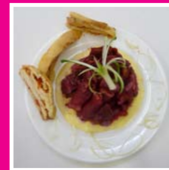
Stuffed vegetarian beetroot cannelloni, served with cheese roux and spicy plaited bread by Jordan Reay