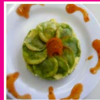
Spinach and tomato cannelloni, set on a bed of cheese roux served with tomato, apple and chilli chutney.