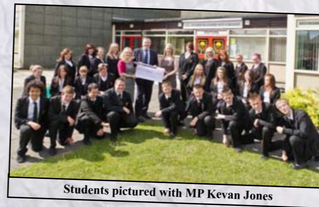
Students pictured with MP Kevan Jones

32 students from The Durham Federation will be going on an expedition to Morocco in July this year. Staff and students will be taking part in a trip of a lifetime including experiencing the Moroccan culture first hand and camel trekking through the desert. Students will be interacting with local village children teaching them traditional British customs and games.