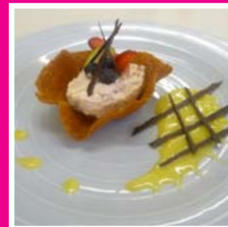
Strawberry cheesecake served in a brandy snap basket, supplied with fresh lemon curd and chocolate strips by Lewis Clarke