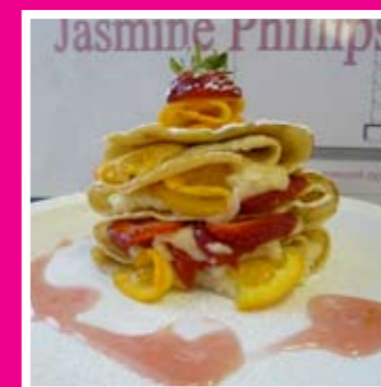
Fruit filled pancakes with a fresh custard sauce served with a peach coulis, topped with strawberries, piled high. By Jasmine Philipps